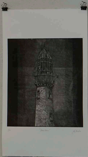
John Busher, Transferrals Series , Etching & Aquatint, Various Dimensions, 2015