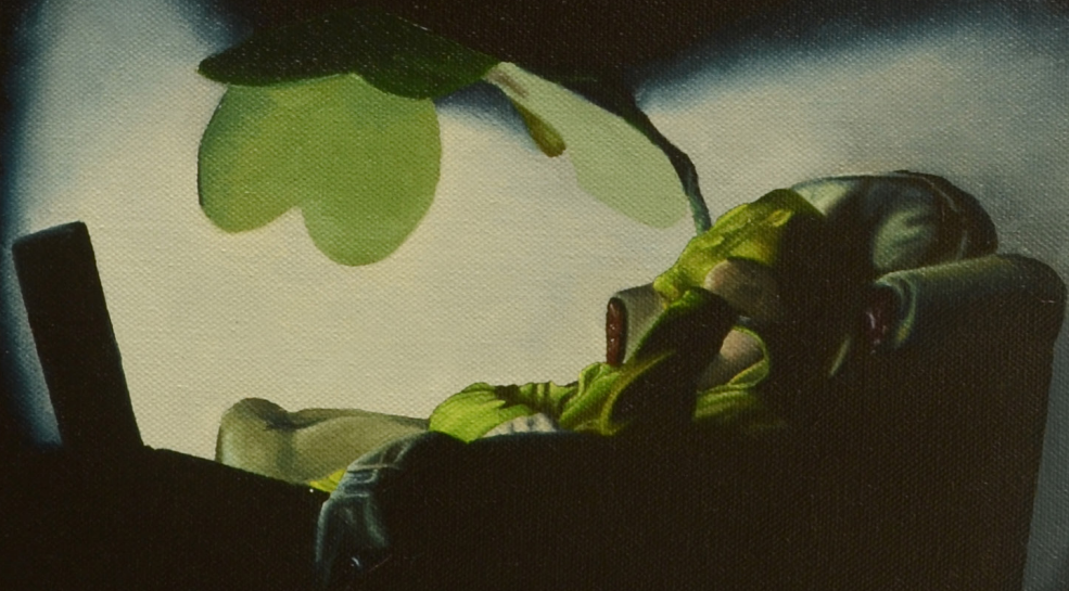
Pat Byrne, The New Baal Fires, Oil on Canvas, 57 x 40cm, 2015